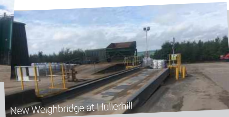
New Weighbridge at Hullerhill