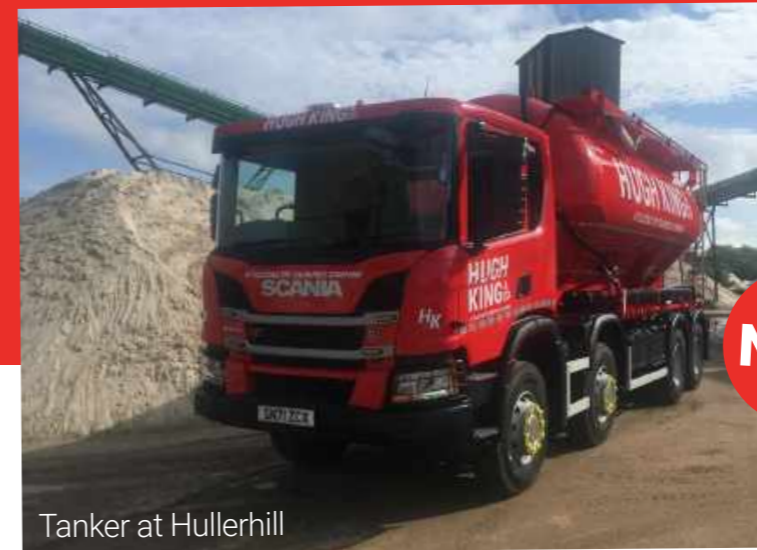
Tanker at Hullerhill