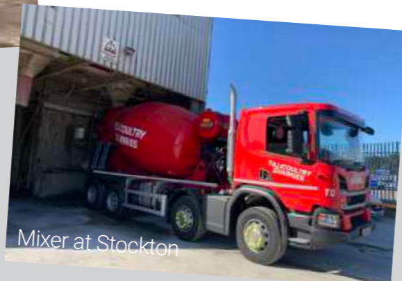
Mixer at Stockton