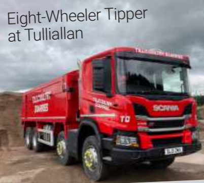
Eight-wheeler Tipper at Tulliallan