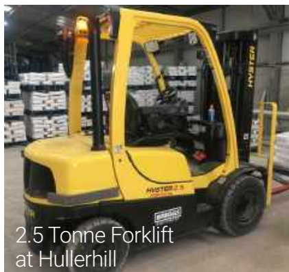
2.5 Tonne Forklift at Hullerhill