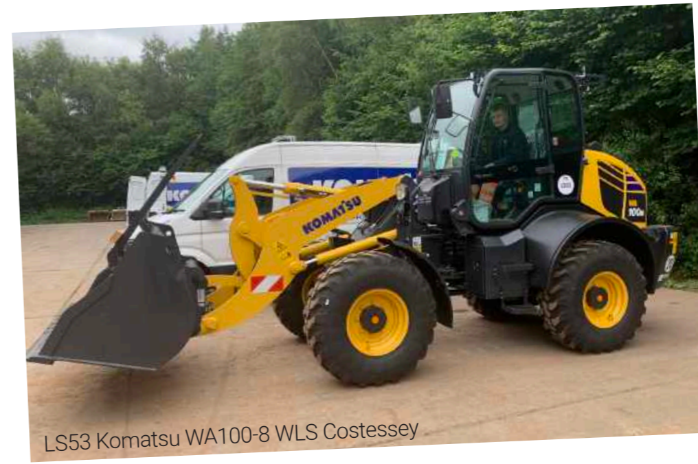
LS53 Komatsu WA100-8 WLS Costessey