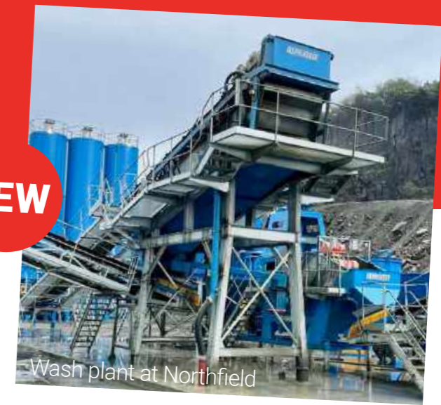
Wash plant at Northfield