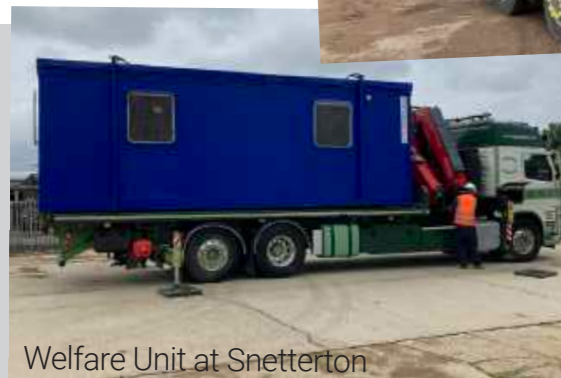
Welfare Unit at Snetterton