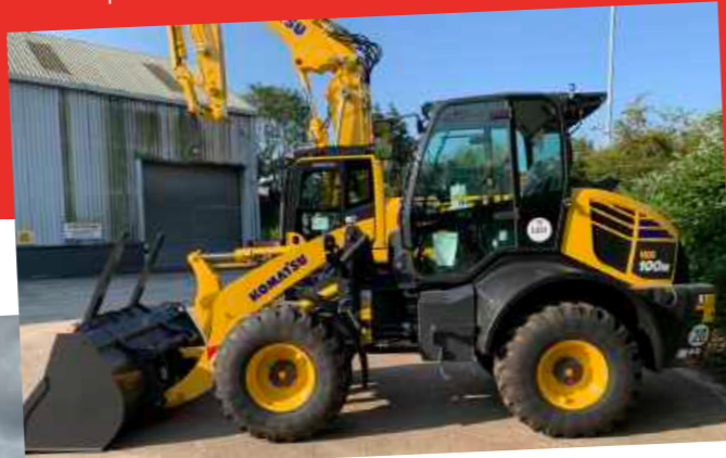
LS54 Komatsu WA100-8 WLS at Snetterton

Cat 775 RDT – this equipment was originally purchased in 2013 but has been given a new lease of life, having undergone a full re-power in 2021 by Finnings to ensure many more years of service for our quarries.