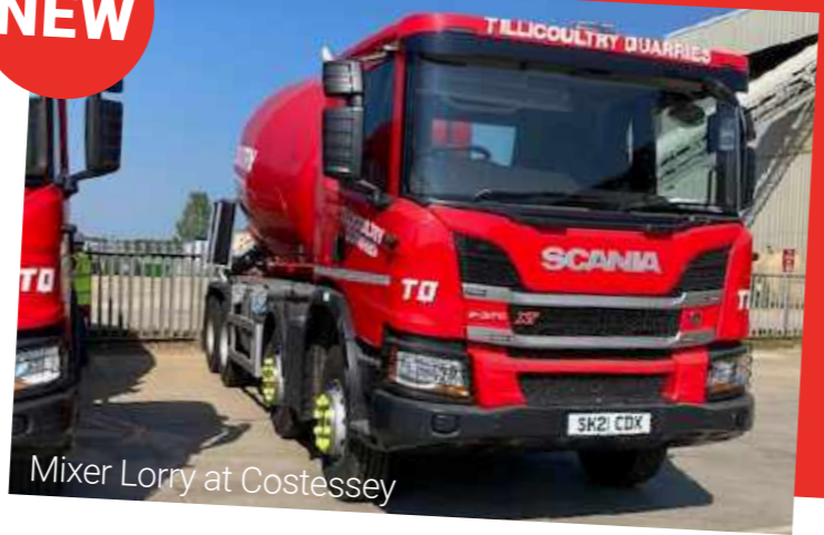
Mixer Lorry at Costessey